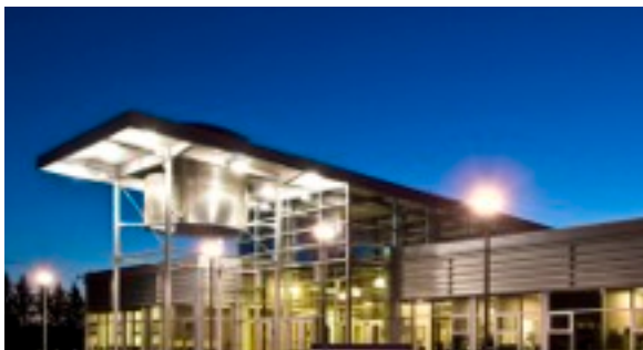
UCVM Clinical Skills Building

Dorothy Russell Havemeyer Foundation - Boehringer Ingelheim - Advanced Monitors Corporation - Canadian Veterinary Imaging - Haygain - Karl Storz Endoskope - Mila International Inc. - Optomed - Trutina Pharmacy Inc. - Zoetis Inc. - University of Calgary Faculty of Veterinary Medicine (UCVM)